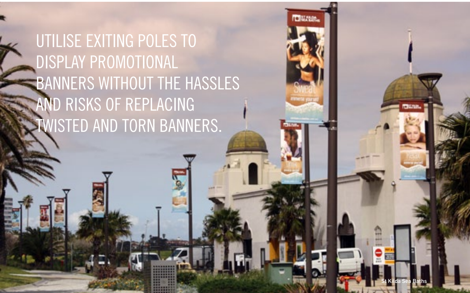
St Kilda Sea Baths

UTILISE EXITING POLES TO DISPLAY PROMOTIONAL BANNERS WITHOUT THE HASSLES AND RISKS OF REPLACING TWISTED AND TORN BANNERS.