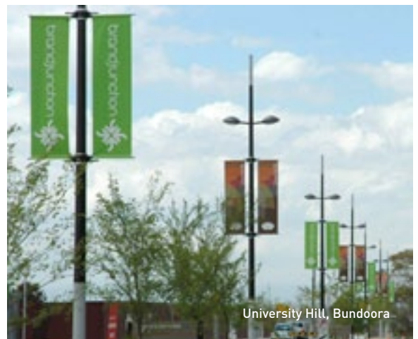
University Hill, Bundooora

The exclusive BannerSaver® design ensures banners have a far longer life than fixed arm banners or flags whilst providing high quality, hassle free promotion.