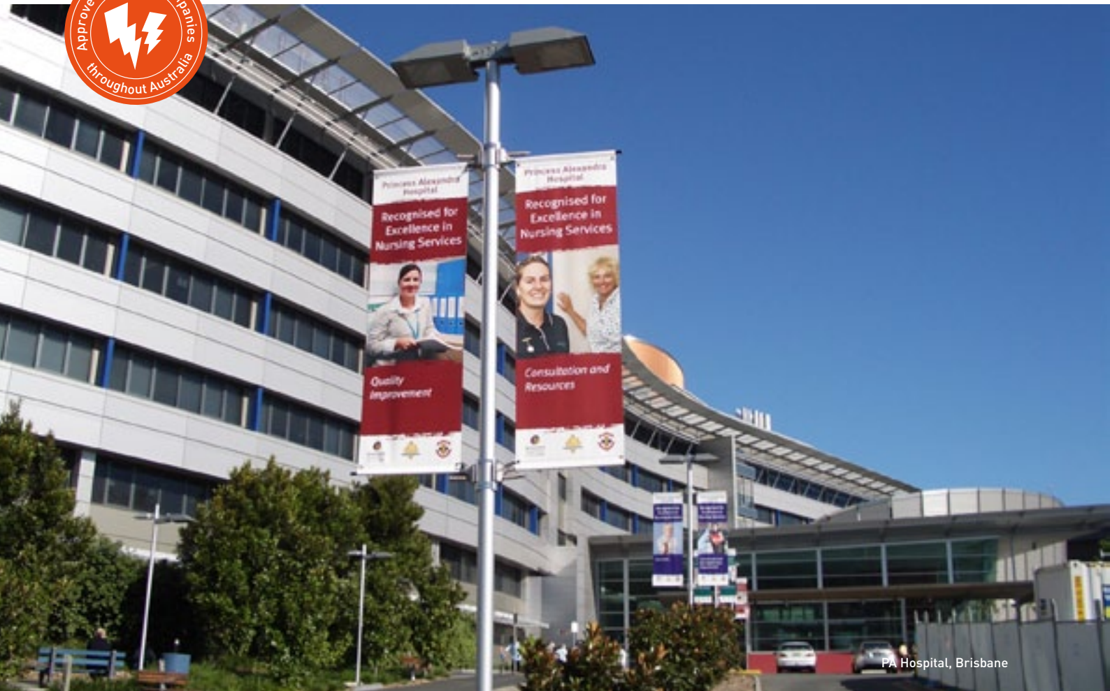
PA Hospital, Brisbane