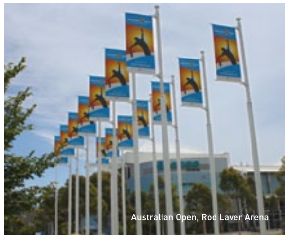
Australian Open, Rod Laver Arena